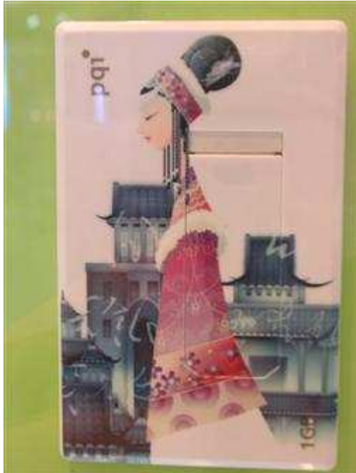
PQI Card Drive U505 Photo: Esther Lam, Digitimes, June 2007