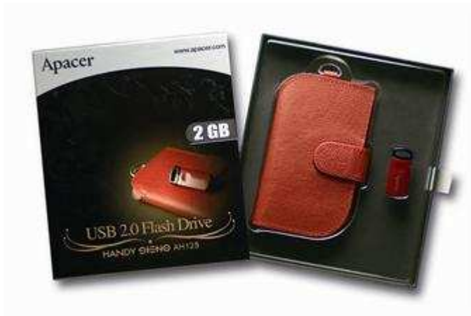
Apacer Handy Steno AH125 USB drive Photo: Esther Lam, Digitimes, June 2007