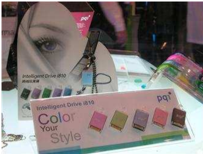
PQI Intelligent Drive i810 Photo: Esther Lam, Digitimes, June 2007