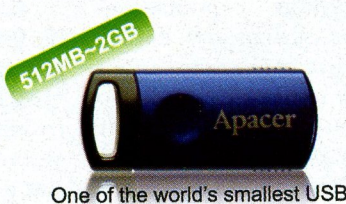
One of the world's smallest USB